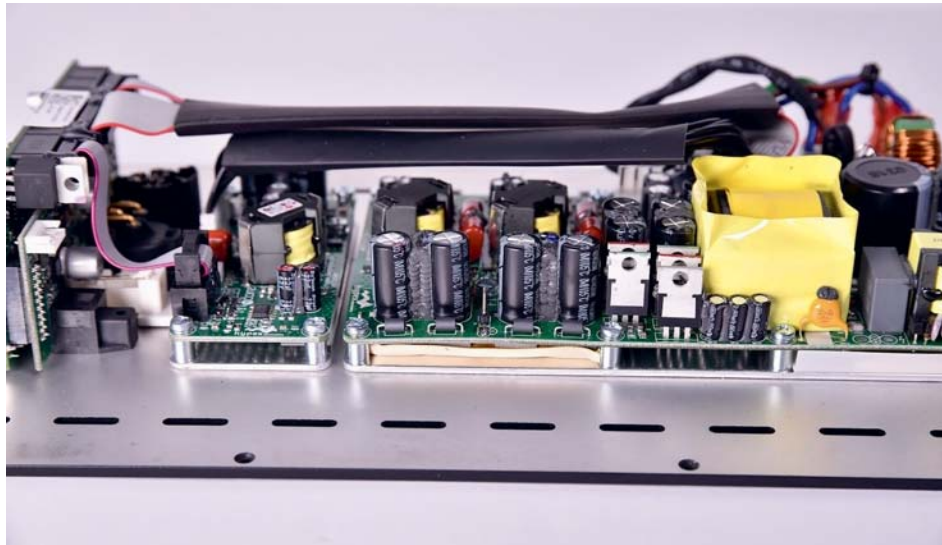
SQT electronics with Hypex Ncore power amplifiers and Hypex DSP system

With the new Square Two model, the Latvian manufacturer Reflector Audio has achieved a major breakthrough in the highly competitive market segment of compact studio monitors. With the courage to come up with unusual concepts, the developers at Reflector Audio designed a coaxial arrangement consisting of a large horn together with four 5" woofers that radiate via bandpass chambers in the edge areas of the horn. Less unusual is the filter concept, which enables linear-phase playback from 200 Hz upwards without resorting to FIR filters. The results can be heard and seen in every respect. The measured values are consistently good, and the Square Two were very impressive in the listening test. The solid and well-made case and the consistently high-quality components round off the good impression.