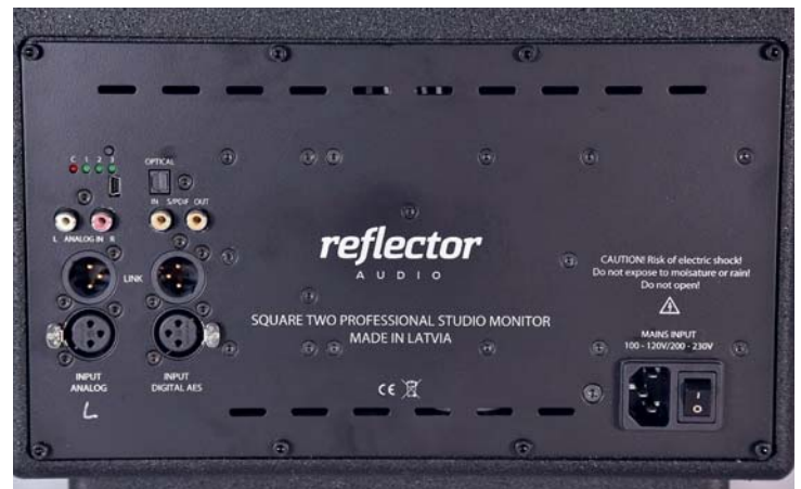
Electronics on the back of the Square Two with analog and digital inputs in all formats

The listening test again took place in an anechoic room, which allows for good comparison and shows the loudspeaker purely without room influences. What was already apparent in the measurement results came to light here clearly. With very good tonal neutrality, the Square Two plays dynamically and powerfully despite its compact dimensions. The bass range doesn't seem underrepresented either. The tweeter is also very nice, reproducing even difficult material with fine resolution and precision without any sharpness.