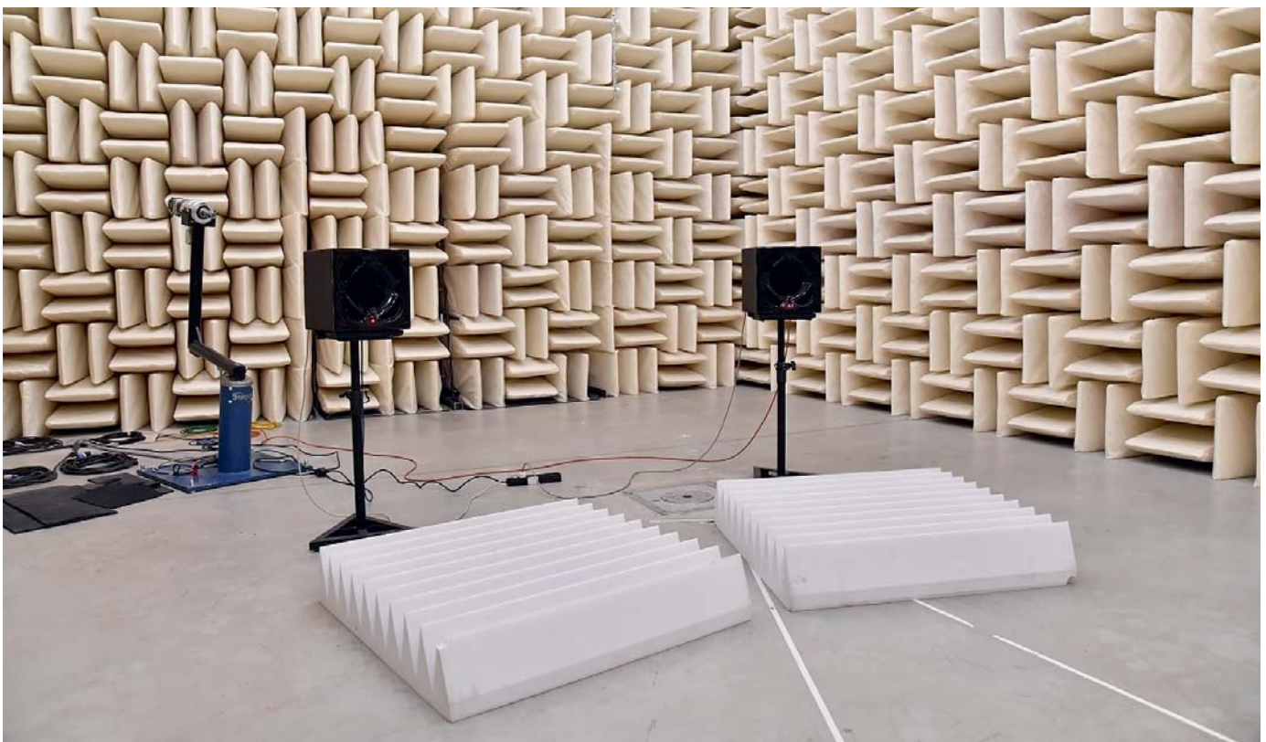
The setup for auditioning in an anechoic room. The absorbers on the floor reduce the floor reflection, which is disturbing in this otherwise reflection-free environment without a diffuse field.