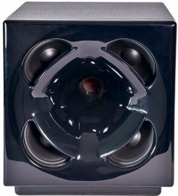
The front view of Square Two; In the middle is the large mid-high frequency horn, surrounded by the four bass drivers, which radiate through openings on the surface of the horn

High-quality components have also been used for the electronics, which are located on a plate in the back panel. The power amplifiers and the DSP system come from the renowned Dutch manufacturer Hypex. A two-channel Ncore module with 2 x 125 W power drives the four woofers, and a 100 W extension module, also from the Ncore series, supplies the tweeter. The DSP system is equipped with a Sigma DSP and, in addition to analog inputs of XLR and RCA connectors, also offers digital inputs in AES/EBU and S/PDIF format, each with a link socket and an optical Toslink input. Settings on the DSP system can be made using the Hypex software via a USB port. There are ten freely definable filters available to the user in the input, the settings of which can be saved in three setups. It should also be mentioned that despite the compact design, the electronics have their own inner housing that protects the circuit boards and components from excessive vibrations.